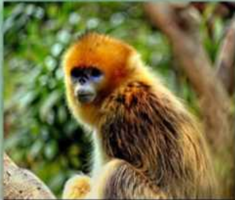
The monkey sat.

Improve these sentences. You might want to add an adverbial phrase, synonyms, noun groups or even have the verb at the beginning of the sentence. Add at least 3 phrases and vocabulary you might use. Write them here. Highlight the ones that you used.