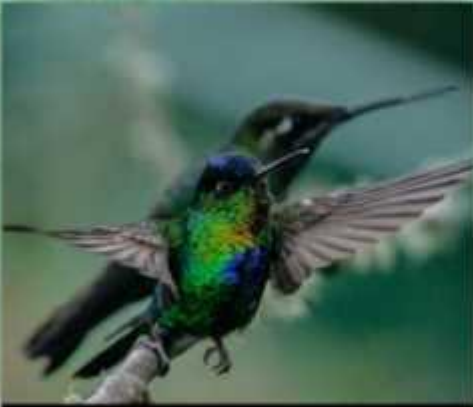
The bird flew.

Improve these sentences. You might want to add an adverbial phrase, synonyms, noun groups or even have the verb at the beginning of the sentence. Add at least 3 phrases and vocabulary you might use. Write them here. Highlight the ones that you used.