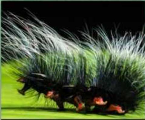
The caterpillar crawled.

Improve these sentences. You might want to add an adverbial phrase, synonyms, noun groups or even have the verb at the beginning of the sentence. Add at least 3 phrases and vocabulary you might use. Write them here. Highlight the ones that you used.