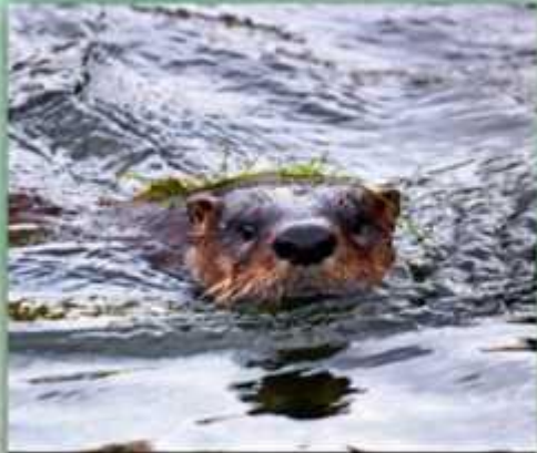
The otter swam.

Improve these sentences. You might want to add an adverbial phrase, synonyms, noun groups or even have the verb at the beginning of the sentence. Add at least 3 phrases and vocabulary you might use. Write them here. Highlight the ones that you used.