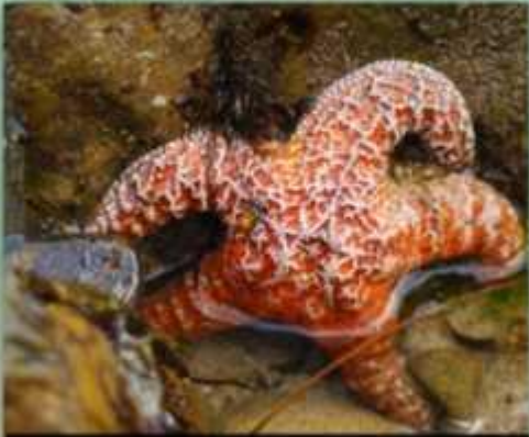
The starfish walked.

Improve these sentences. You might want to add an adverbial phrase, synonyms, noun groups or even have the verb at the beginning of the sentence. Add at least 3 phrases and vocabulary you might use. Write them here. Highlight the ones that you used.